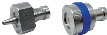
Post-style dies for longevity and ease-of-use.