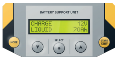
Intuitive interface available in 22 languages