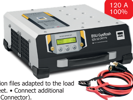
Supplied with cables (5 m - 25 mm 2 )