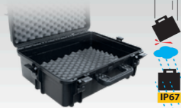
Carry case 060432