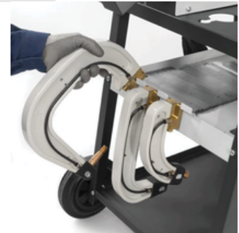
Integrated arm support