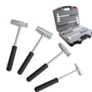
4 Alu Hammer Kit