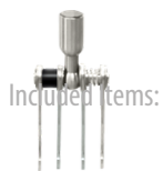
4 Gripping Multihook Head